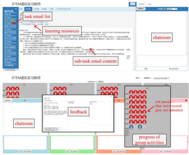
Figure 1. STEM teacher virtual internship system interface (above: preservice teacher interface; below: tutor interface).

This study used the STEM virtual internship system to support STEM learning design practice (Figure 1). In the online environment, pre-service teachers worked as interns at a fictitious primary school. The participants were randomly divided into eight groups, each made up of pre-service teachers of science, technology, engineering and mathematics. They had to collaborate on a series of interrelated tasks to design a STEM learning plan, such as selecting a course topic, designing course objectives. During the 12-week internship (2 hours per week), the virtual tutor sent the requirements of each sub-task and related learning resources by email. Participants learn the relevant resources independently and discuss each task with others to complete specific tasks. After group discussion, participants proposed